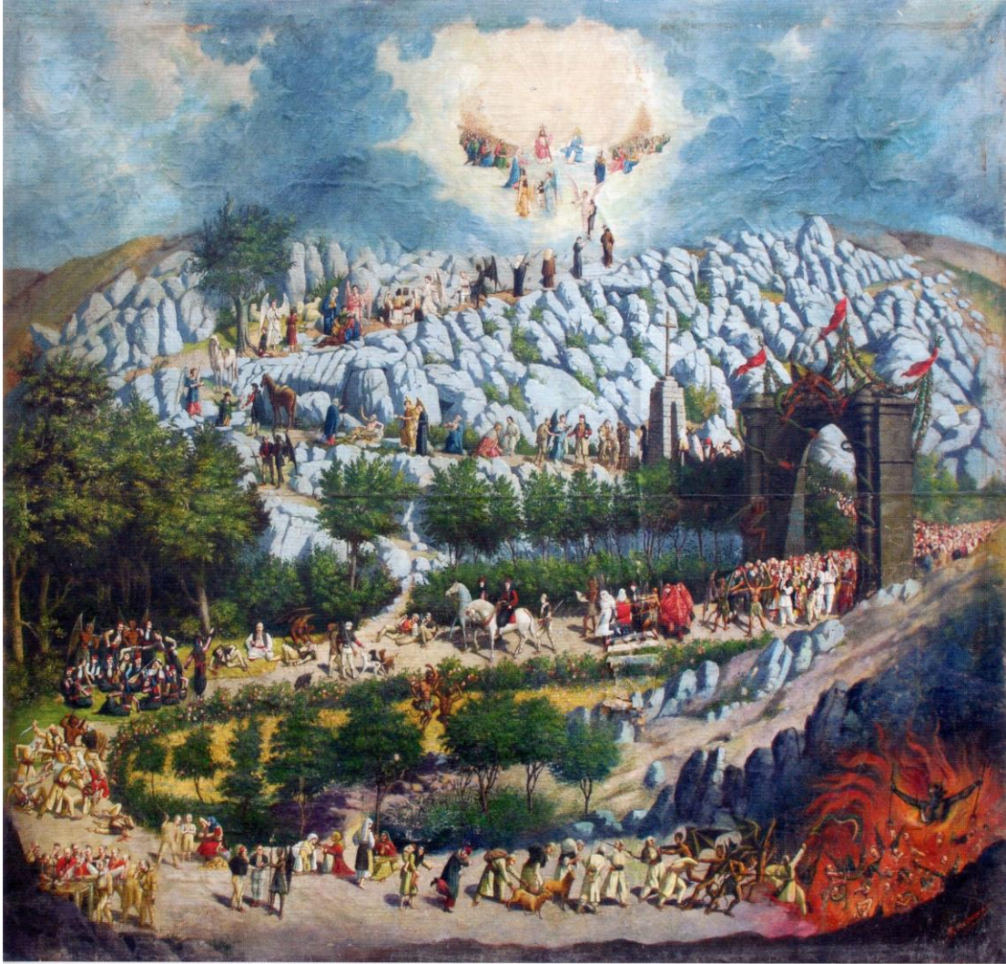
Kolë Idromeno, Two Paths of Life , oil colors on canvas, 1893, The Historical Museum of Shkodra

The most distinguishable ones are those which belong to the North like: Zadrima, Dikagjin, Kelmedi and Shkodra without leaving apart the costumes of Middle and South Albania. By mixing up the muslim and catholic clothes, it gave a magical message showing the two religions 30 living perfectly together.