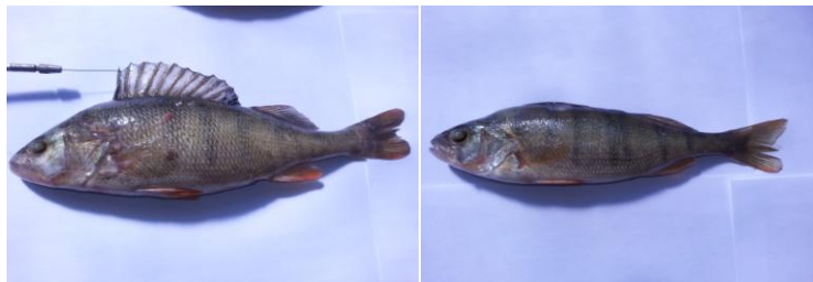
Figure 1. Perca fluviatilis infested with metacercariae of Diplostomum spp.