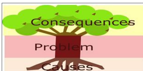
Figure 3. A Problem Tree

The problem tree technique – this technique enables students to understand things better by analyzing the factors that cause the problem / problems and their consequences. Students learn how to present problems by using the picture of a tree. The tree consists of 3 main parts: a) the roots, the trunk and the branches. The trunk is the problem and the roots and the branches are respectively its causes and consequences. Students should collaborate with each other and find the causes and effects of a certain problem. (Bright Hub PM, 2019)