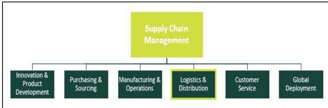
Picture 2. Supply Chain Management