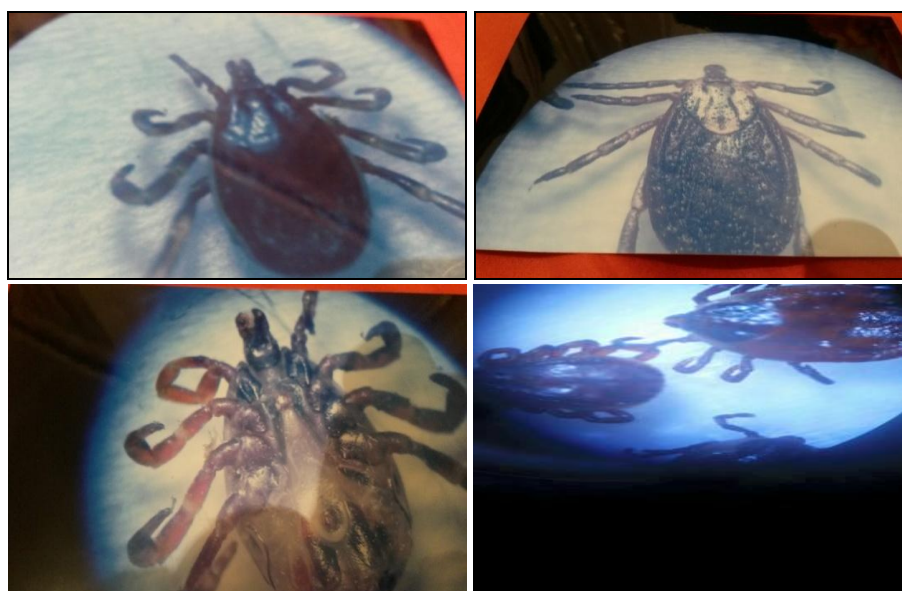
Fig. 3 Ticks unde stereomicroscope identification