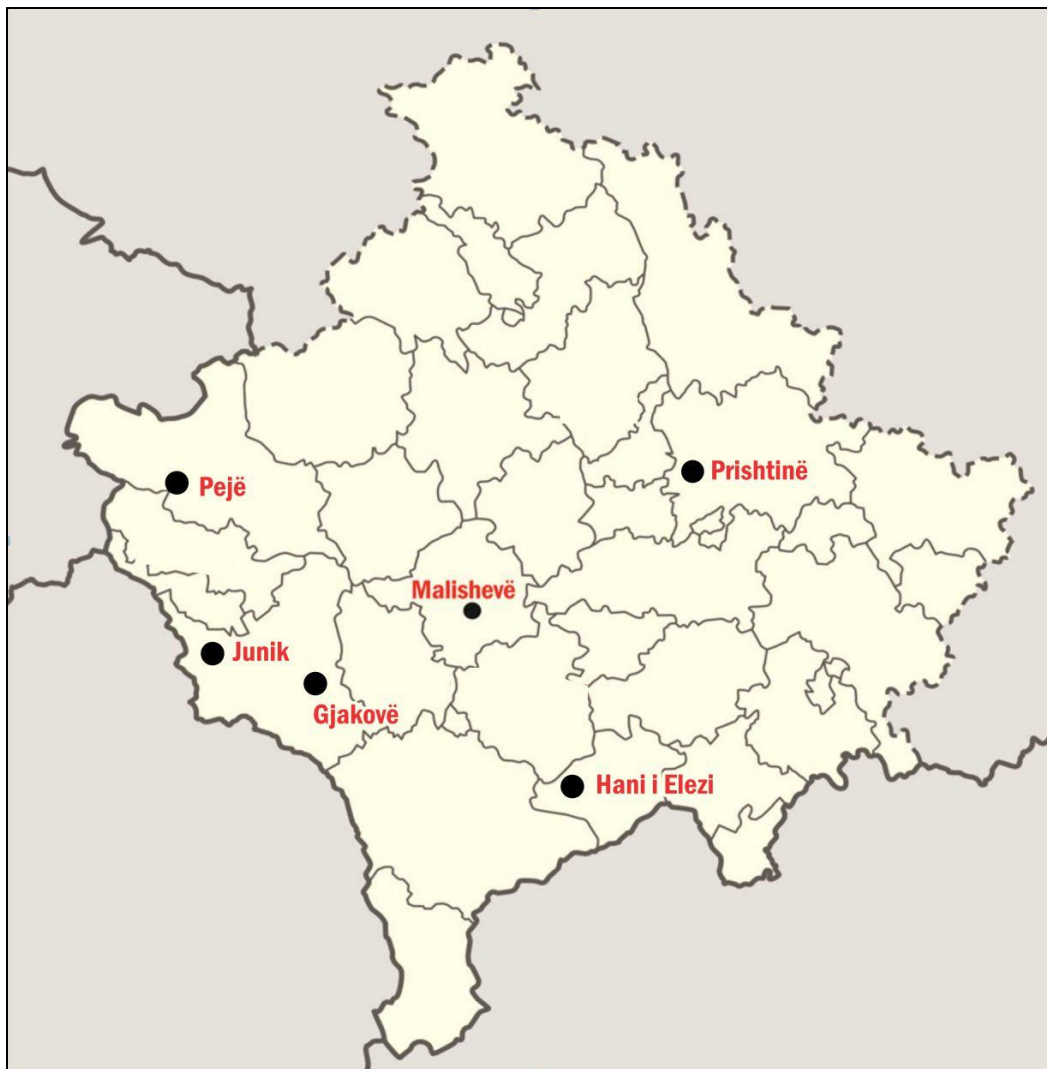
Fig. 1. Map of the study area.

Investigation was done during 2012-2014 in 5 municipality of Kosovo sheep which a in border of the counties; Albania, Macedonia, Serbia and Montenegro. The study are included Peja, Gjakova, Junik, Hani i Elezit, Prishtina. Serum and tick were collected during summer of 2012-2014 from 137 sheep. Animals was note in the system of the identification unit of Kosovo Food and Veterinary Agency. All collect sera were tested using the ELISA for quality and quantity determination IgG and IgM antibody to CCHFV in the Frirch-Loefer Institute (FLI) Greiswald, Germany. Samples with a positive or inclusive result in the in-house ELISA were rerun in a sheep adapted commercial CCHFV-IgG-ELISA. In cases of divergent results samples were tested in a sheep adapted commercial CCHFV-IgG-IFA (Evrooimun Lubeck, Germany) for final confirmation.