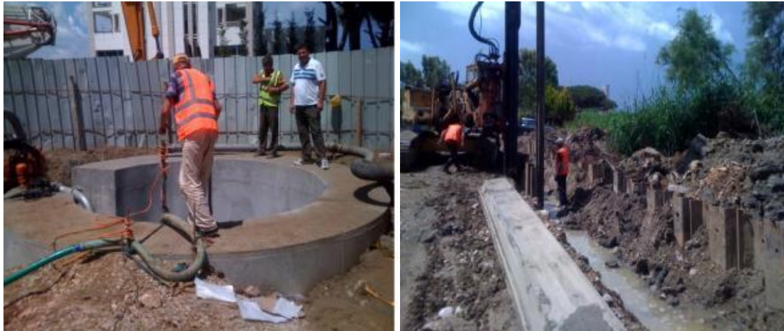
Photo 2: the tubes through which the waste water is going to pass, to be discharged to the Waste Water Treatment Plant.

Golem is a coastal village in the Kavaja region which has become a popular tourist destination in the last years. Due to complete lack of the sewerage collecting and treatment systems in Golemi beach area, most of the sewerage waste is discharged directly to the surface waters, streams or even into the sea.