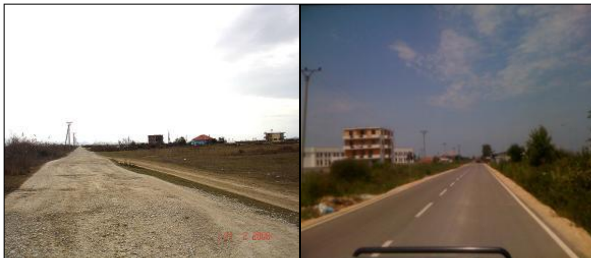
Shijak, construction of secondary road

Shijak is a little town located about 30 km west of Tirana. Even though it is a very small town, several small factories are located there. However, due to the lack of a paved road the transport in and out of the goods produced was very difficult.