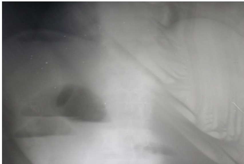
Photo 1. Direct abdominal ro-graphy with numerous central levels

The echographic examination showed no visible signs except for the distinct meteorism of the small intestine.