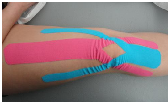
Fig1. Apply of Kinesio Tape on quadriceps femoris muscle.

We observed the change of pain, while walking for 10 meters at normal speed for each patient, before, a day after the application and three days after the application of Kinesio Tape on quadriceps femoris muscle, with the help of numerical pain rating scale - NRS. The worse knee, as selected by the patient was the “index” knee. Pain was assessed by numerical pain rating scale (NRS), by instructing the patient to choose a number from 0 to 10 that best describes their current pain. 0 would mean “no pain” and 10 would mean “worst possible pain” (19).