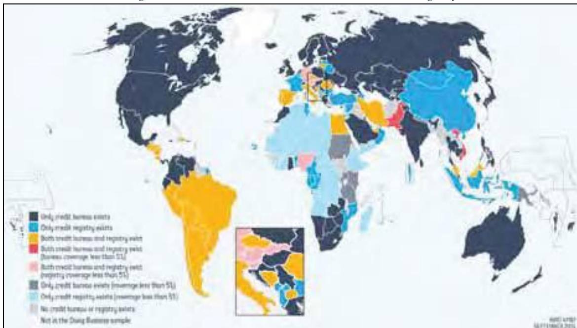
Figure 2. Which economies have a credit bureau or registry?

from 22 of 145 economies to 58 of 189 economies. Globally, 28 economies both have a credit registry and a credit bureau covering at least 5% of the adult population.