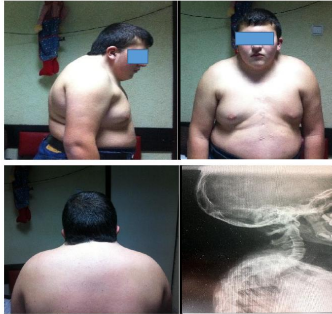
Figure 1. Case 1. A 15-years-old boy diagnosed at delivery with Klippel – Feil syndrome. Note the short neck, low hairline and symmetric shoulders. (Scar on the thorax after surgical repair of total anomalous venous return)