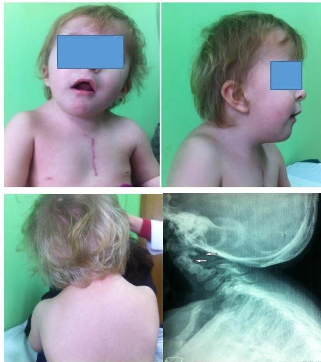
Figure 2. Case 2. Patient with Klippel-Feil syndrome and anomaly of the occipito-cervical junction. The images show an elevated left shoulder due to a Sprengel anomaly, a short, webbed neck, and a low hairline. (Scar on the thorax after surgical repair of nonrestrictive atrial septal defect). X-ray shows occipito-cervical junction.