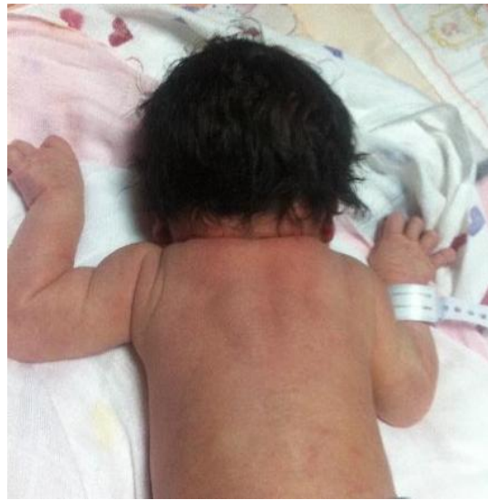
Figure 4. A 2-days old neonate with Klippel-Feil syndrome. The image shows an elevated right shoulder due to a Sprengel anomaly, a short, webbed neck, and a low hairline.